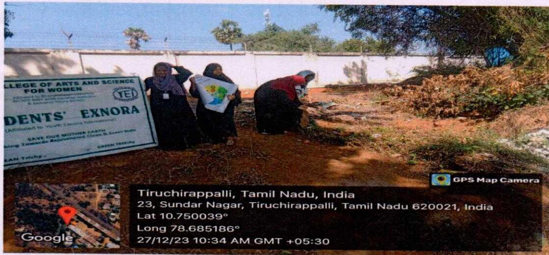
Our students removed plastics in the campus

S 4/11/24 PRINCIPAL AIMAN COLLEGE OF ARTS & SCIENCE FOR WOMEN TIRUCHIRAPPALLI-620 021