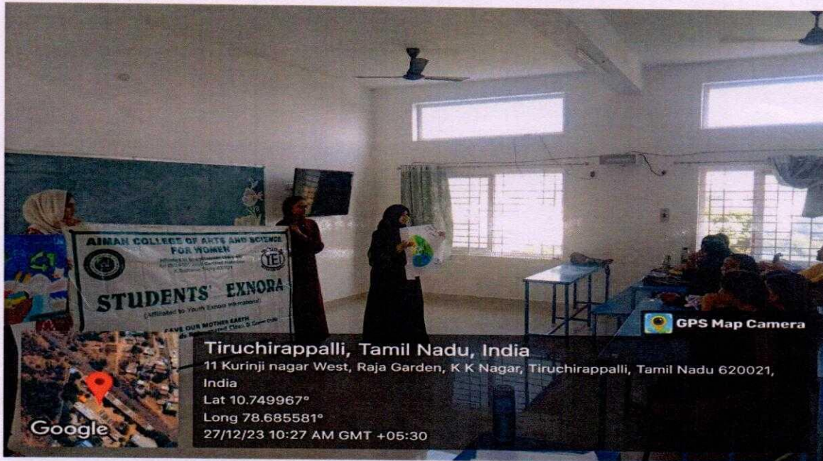
Awareness talk on reduce waste in the classroom